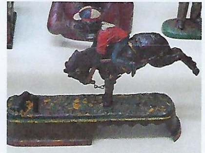
Bronco rider Bank

There is more to see than can be easily fit into a single day. Why not divide your tour up and do it in sections so you can really see and study it all. We had more than 500 visitors in 2017. Hope to see you in 2018!