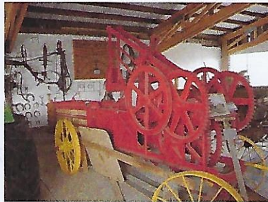
Hand Tie Wire Baler