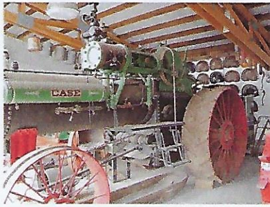
Case Steam Tractor