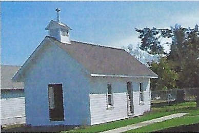
The Wedding Chapel Under Construction