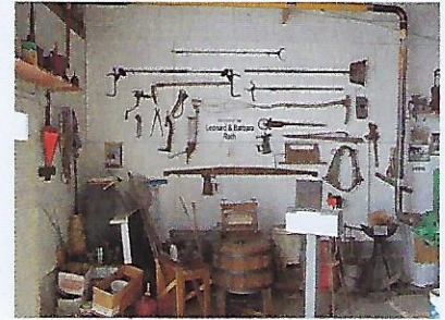
Some of the many tools

These are just a few of the many exhibits on view at The Harrisburg Area Museum. More are being added on a regular basis. The House is full of old artifacts. It all adds up to a fine display of our heritage. A heritage that we can be proud of and that reveals something of the sacrifice and determination of our forefathers. We believe that it is important to preserve such evidences. For the 'old timer' it is a nostalgic tour of days long gone. For the modern day viewer it is a lesson in what can be done when there is a will to do it. We believe you would enjoy a tour and encourage you to do so and invite your friends and relatives. Our hours are normally 10:00 - 4:00 Tuesday, Thursday and Saturday.