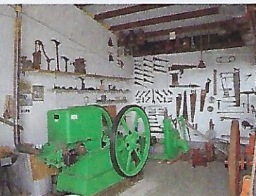
OSU Irrigation Pump