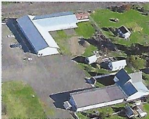
October 29, 2003