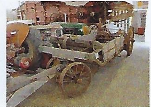
Manure Spdr. & Thresher

YES...I want to help the Museum and enclose a 'one time' contribution of: