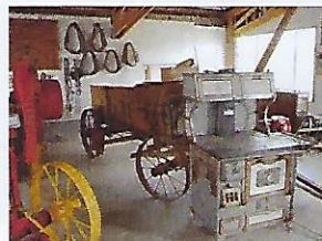
Cook Stove ++